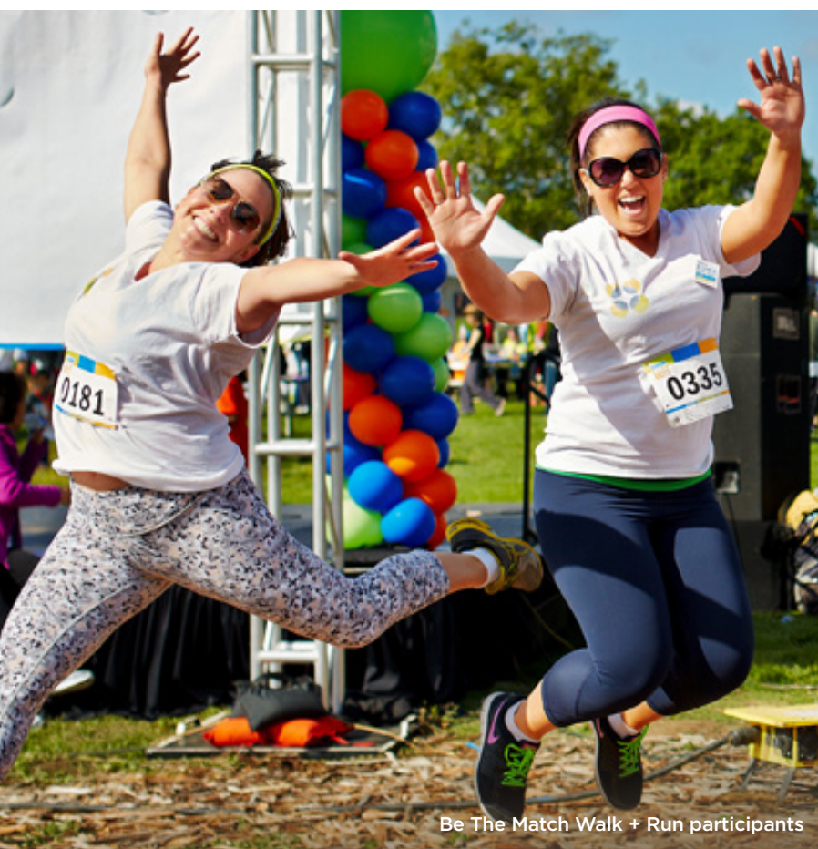
Be The Match Walk + Run participants

It was inspirational to think that, somewhere out there, there was a family who had a whole lot of bad news and no matter what happened, I, as a donor, had given them a spark of hope.'